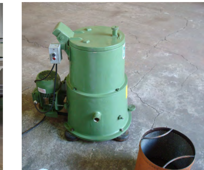
▲ Manual centrifuge for small quantities (up to 500 kg / h) ▲

Our cutting oil recovery and machining chip cleaning systems solve the problems of a sensitive area of our customers, which is waste control. In metallurgical industries, approximately 30% of the used cutting oil is carried away by the chips, causing an environmental problem and at the same time a waste. For integral oils, such a system pays in days and in terms of non-ferrous chips, the return for the valorization of clean chips is very fast. Imagine, eliminating a problem and still making a profit, what more can we want?