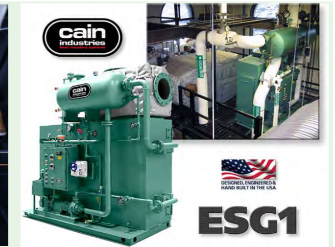
▲ Heat recovery system by Cain ▲

ARCORI's production processes are based on Industry 4.0, for this we have manufacturing partners strictly chosen so that the design of machines, equipment and systems that come out of our modern CAE/CAD and CAM software are strictly followed with dimensional accuracy and high quality.