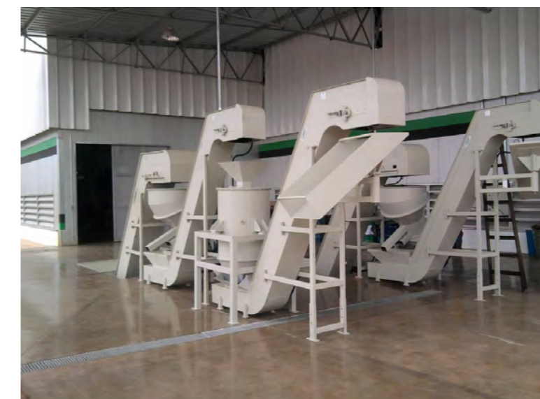
▲ Continuous chip grinding and cleaning line

We manufacture mixers, raw material handling systems, conveyors and much more.