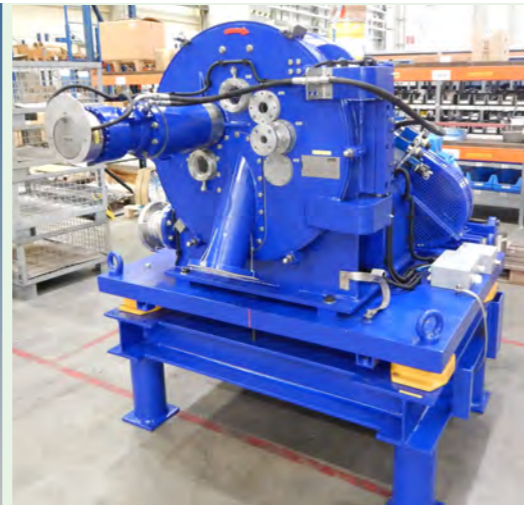
▲ Peeler centrifuge for chemical products ▲

Never before has there been so much talk about productivity, lower production costs and competitiveness without obviously leaving out quality. Allied to all these concepts, we cannot forget another not less important one, that of sustainability.