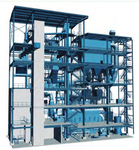
▲ Heat recovery system by Cain ▲

ARCORI's production processes are based on Industry 4.0, for this we have manufacturing partners strictly chosen so that the design of machines, equipment and systems that come out of our modern CAE/CAD and CAM software are strictly followed with dimensional accuracy and high quality.