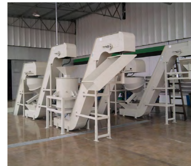
▲ Continuous chip grinding and cleaning line

We manufacture raw material handling systems, conveyors and much more.