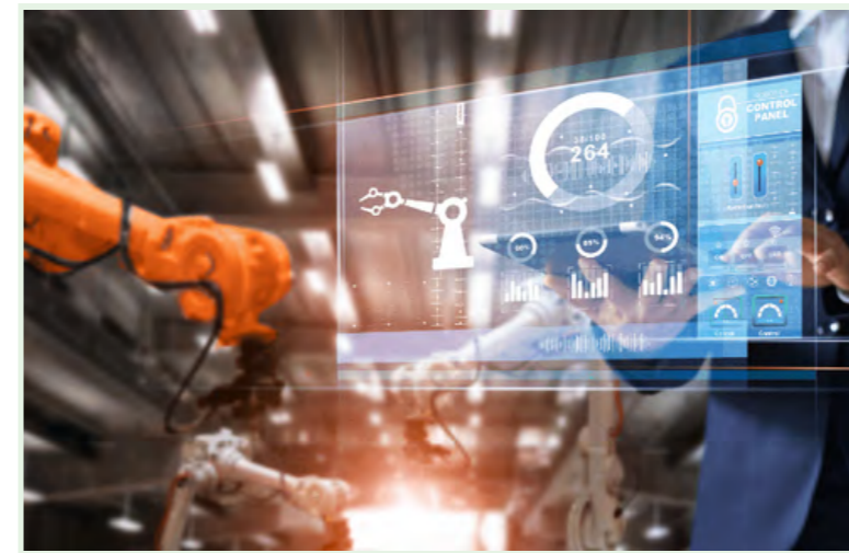
▲ Our processes are always oriented to Industry 4.0