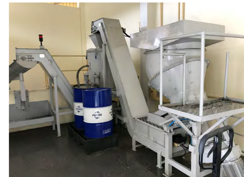
▲ Chip Metal oil recovery system line with crushing ▲

Our cutting oil recovery and machining chip cleaning systems solve the problems of a sensitive area of our customers, which is waste control. In metallurgical industries, approximately 30% of the used cutting oil is carried away by the chips, causing an environmental problem and at the same time a waste. For integral oils, such a system pays in days and in terms of non-ferrous chips, the return for the valorization of clean chips is very fast. Imagine, eliminating a problem and still making a profit, what more can we want?